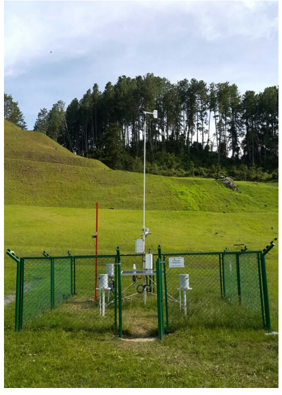
Speedwell Weather Station: Medellin, Colombia